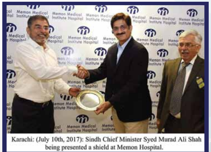
Karachi: (July 10th, 2017): Sindh Chief Minister Syed Murad Ali Shah being presented a shield at Memon Hospital.