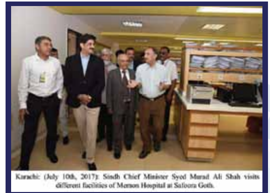
Karachi: (July 10th, 2017): Sindh Chief Minister Syed Murad Ali Shah visits different facilities of Memon Hospital at Salfora Goth.