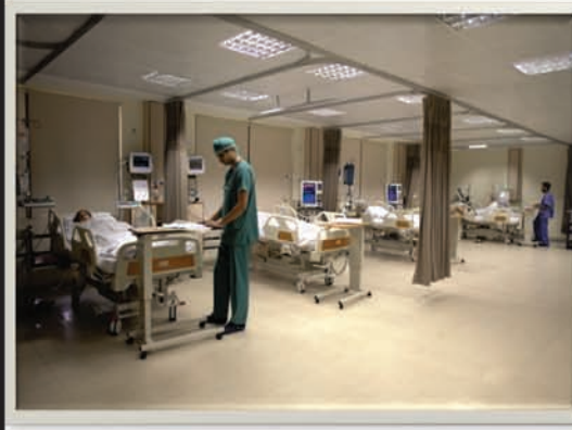
INTENSIVE CARE UNIT

Emergency services, Intensive care unit and 1st Floor Inpatient department were initiated earlier this year in January 2011