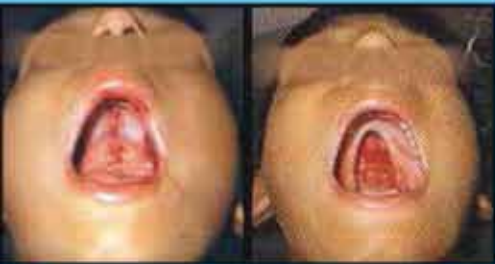
Before Surgery & After Surgery