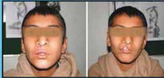
Before Surgery & After Surgery