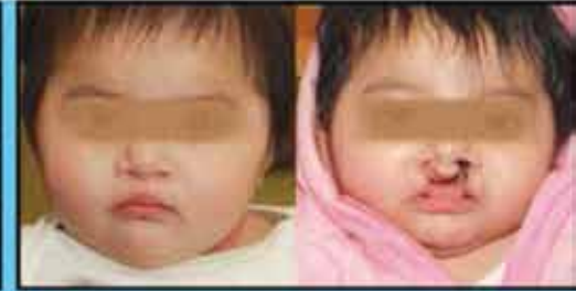
Before Surgery & After Surgery